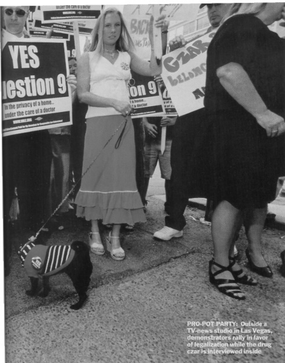
PRO-POT PARTY: Outside a TV-news studio in Las Vegas, demonstrators rally in favor of legalization while the drug czar is interviewed inside

a way to understand the problem. The czar, who told TIME he has never smoked pot, believes marijuana to be not only a gateway drug but also incredibly detrimental in its own right—causing driving accidents, domestic violence, health risks and crippling addiction. He thinks the legalization argument is absurd, especially when proposed by libertarian Republicans who are so doctrinaire he finds them to be outside his party. “This is great talk at 2 a.m. in a dorm room, that all laws should be consistent. But the real world isn’t consistent. It’s ludicrous to say we have a great deal of