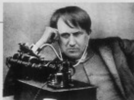
THOMAS EDISON The man behind the light bulb and phonograph didn't speak until age 4

Dyslexia didn't stop these famous men and women from achieving greatness. In some cases it may have fueled their creative fires