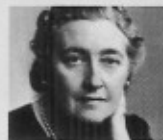
AGATHA CHRISTIE The Queen of Crime struggled with words and yet wrote nearly 100 books, which have sold 2 billion copies