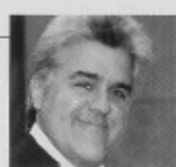
JAY LENO Tonight Show host may flub a cue card, but the show goes on